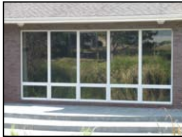
The reflection of trees, plants, and sky in windows make these structures hard for birds to see.

One of the largest threats to birds is window strikes. Birds, while migrating or trying to escape predators see the reflection in the window and thus cannot see the window. Consequently, birds often fly into windows.